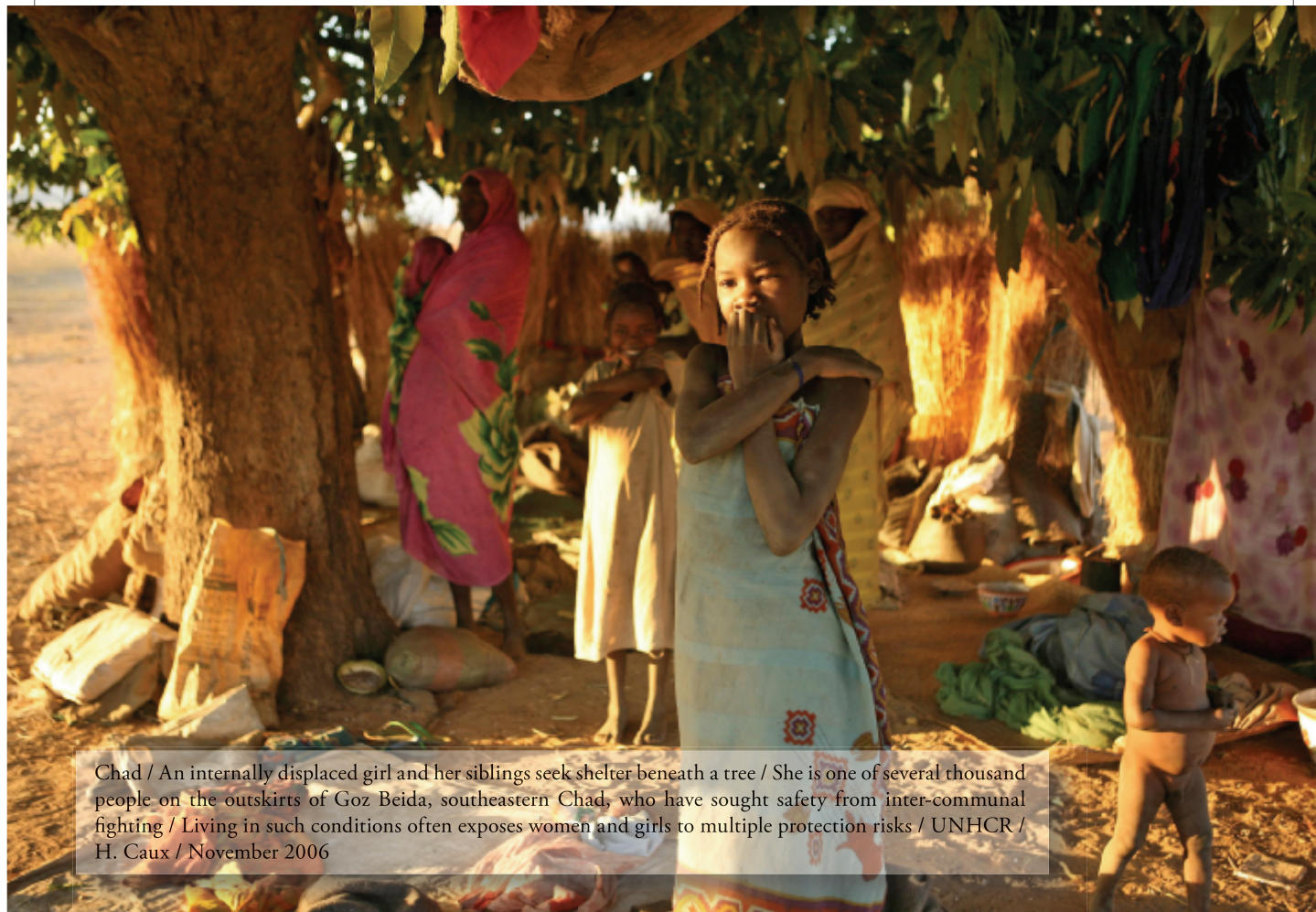
Chad / An internally displaced girl and her siblings seek shelter beneath a tree / She is one of several thousand people on the outskirts of Goz Beida, southeastern Chad, who have sought safety from inter-communal fighting / Living in such conditions often exposes women and girls to multiple protection risks / November 2006