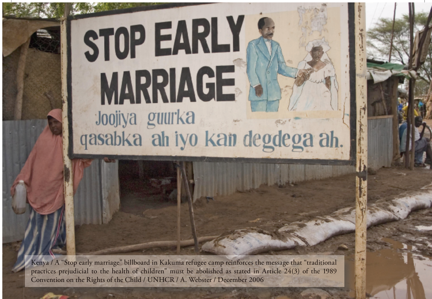
Kenya / A “Stop early marriage” billboard in Kakuma refugee camp reinforces the message that “traditional practices prejudicial to the health of children” must be abolished as stated in Article 24(3) of the 1989 Convention on the Rights of the Child / December 2006