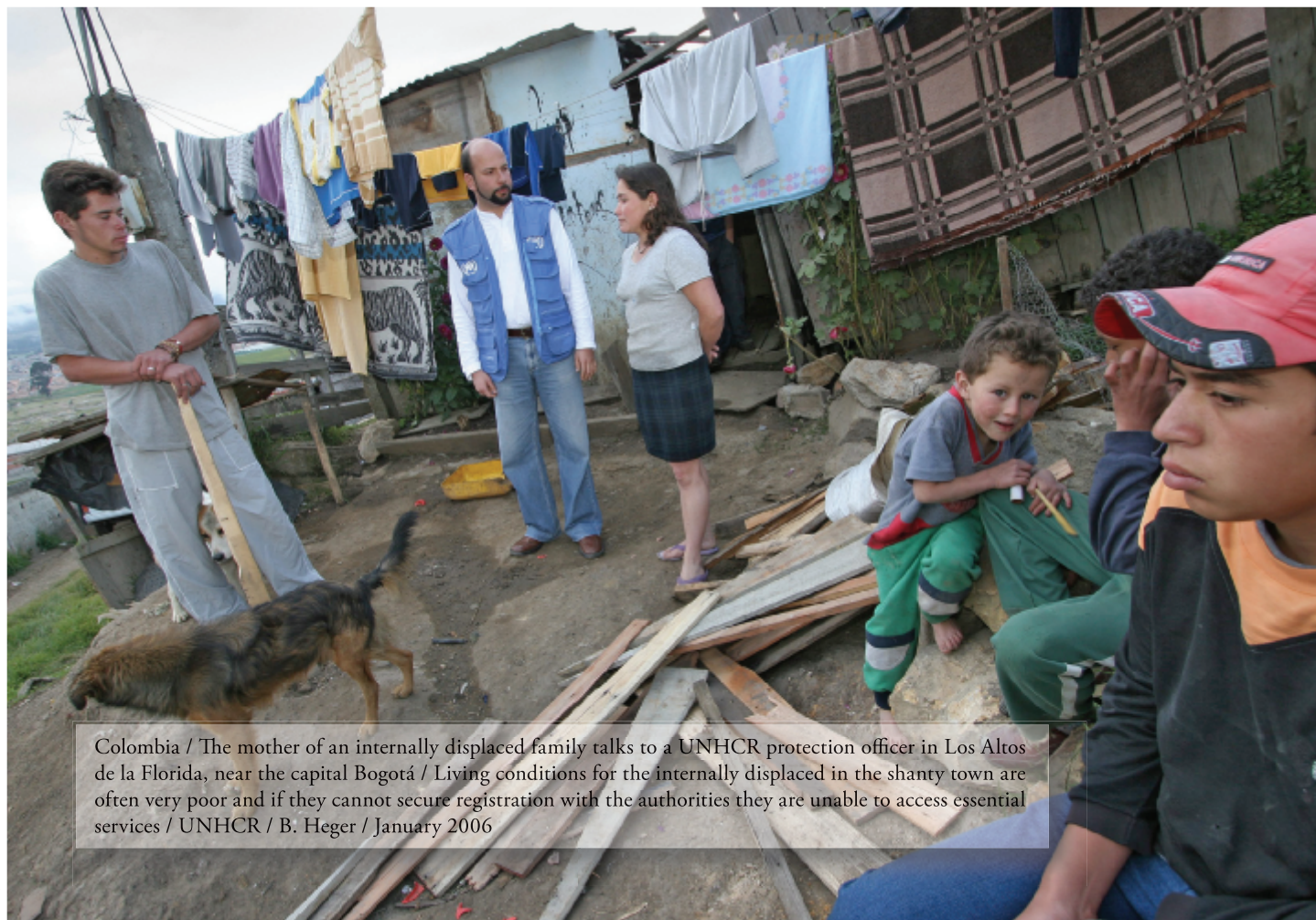
Colombia / The mother of an internally displaced family talks to a UNHCR protection officer in Los Altos de la Florida, near the capital Bogotá / Living conditions for the internally displaced in the shanty town are often very poor and if they cannot secure registration with the authorities they are unable to access essential services / UNHCR / B. Heger / January 2006