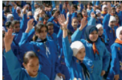
Syria / Iraqi refugee girls join Syrian girls at a school in Saida Zeinab, Damascus / UNHCR / J. Wreford / 2007

Well-designed education programmes can help girls and women exercise other rights, are an important part of protection strategies, and can indeed be “life-saving” and “life-supporting”. 289