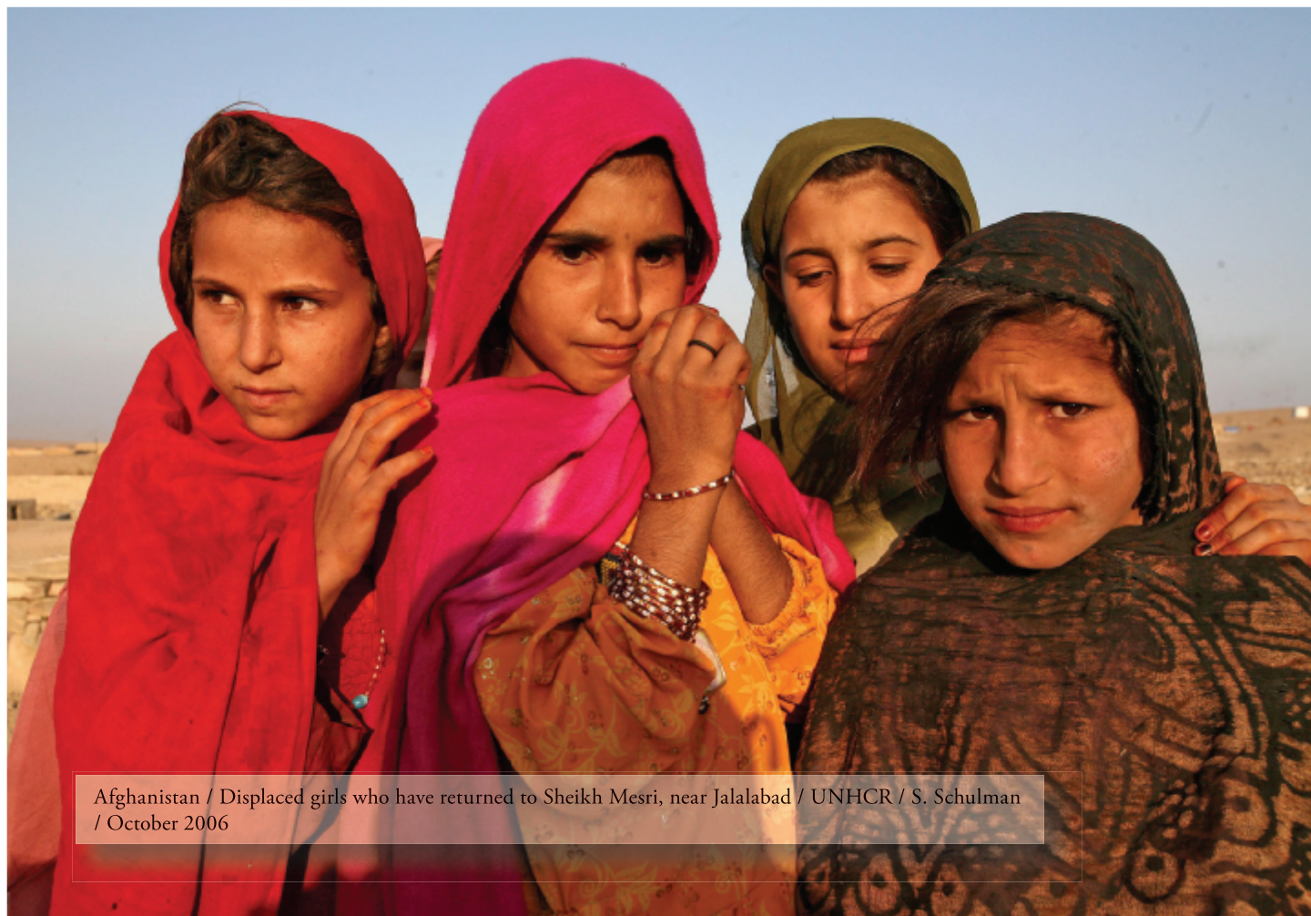
Afghanistan / Displaced girls who have returned to Sheikh Mesri, near Jalalabad / UNHCR / S. Schulman / October 2006