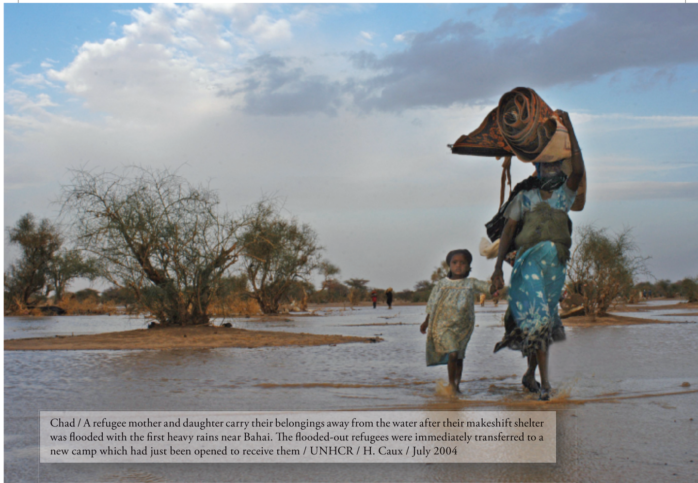
Chad / A refugee mother and daughter carry their belongings away from the water after their makeshift shelter was flooded with the first heavy rains near Bahai. The flooded-out refugees were immediately transferred to a new camp which had just been opened to receive them / UNHCR / H. Caux / July 2004