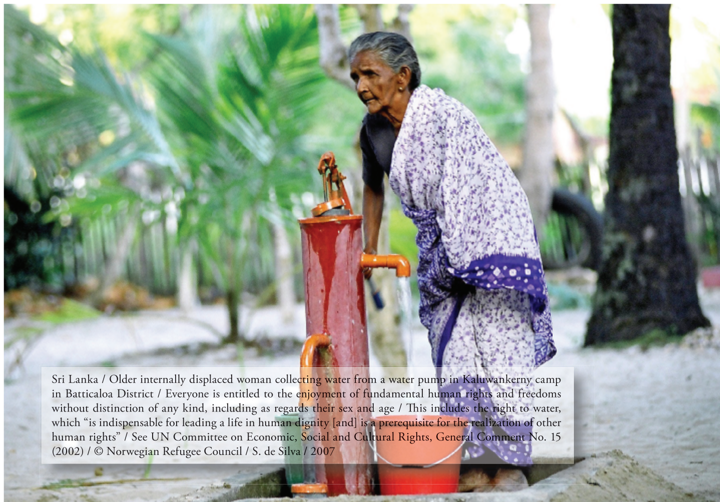
Sri Lanka / Older internally displaced woman collecting water from a water pump in Kaluwankerny camp in Batticaloa District / Everyone is entitled to the enjoyment of fundamental human rights and freedoms without distinction of any kind, including as regards their sex and age / This includes the right to water, which “is indispensable for leading a life in human dignity [and] is a prerequisite for the realization of other human rights” / See UN Committee on Economic, Social and Cultural Rights, General Comment No. 15 (2002) / © Norwegian Refugee Council / S. de Silva / 2007