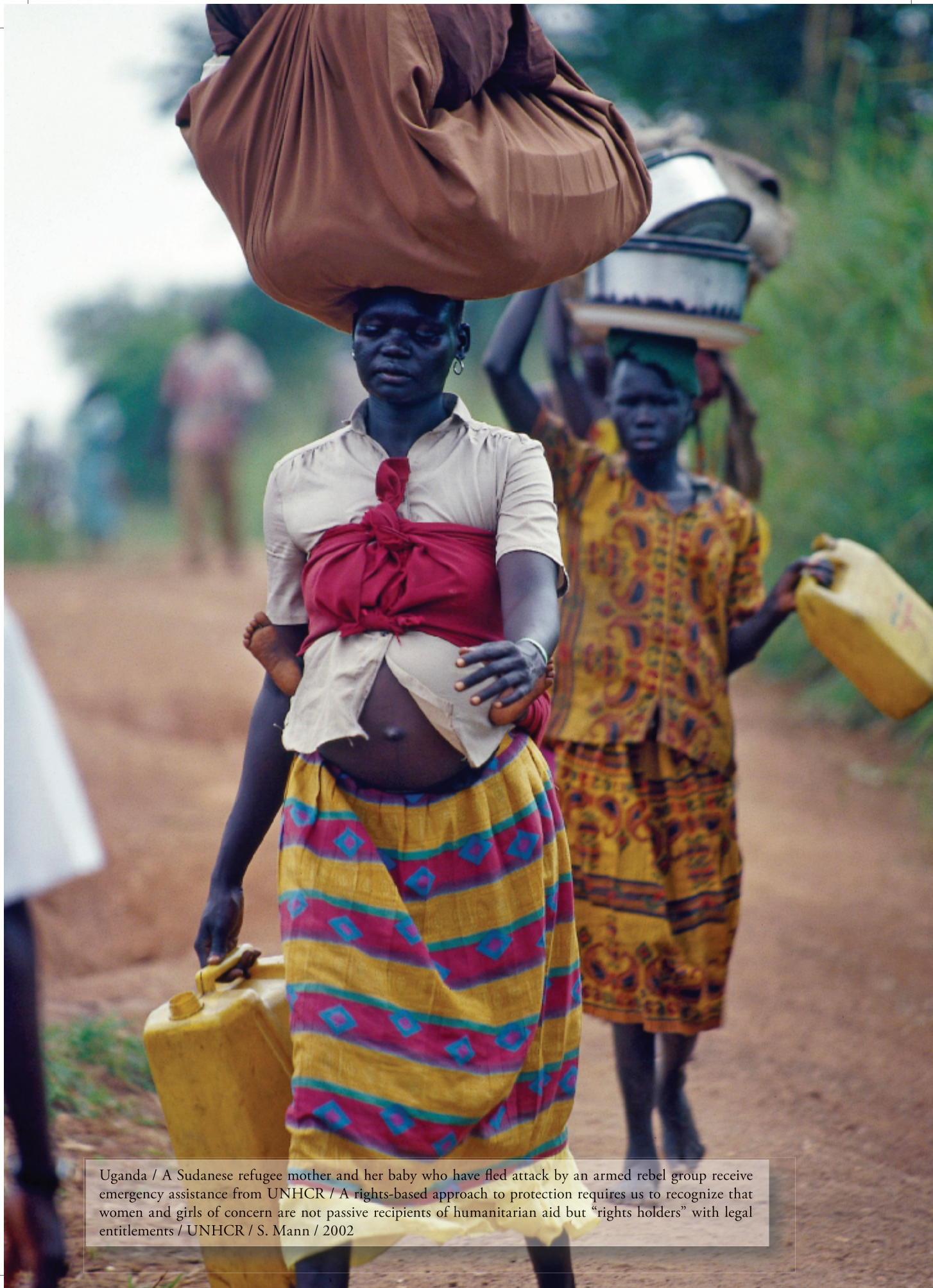
Uganda / A Sudanese refugee mother and her baby who have fled attack by an armed rebel group receive emergency assistance from UNHCR / A rights-based approach to protection requires us to recognize that women and girls of concern are not passive recipients of humanitarian aid but “rights holders” with legal entitlements / UNHCR / S. Mann / 2002