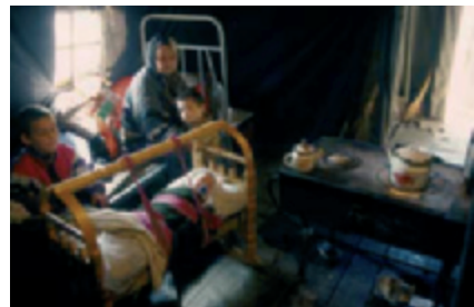
Russian Federation / Ingushetia / Chechen IDPs / A grandmother minds her children in a tented camp in Sunzhenski District / March 2003

Discrimination against women not only on account of gender, but also race, caste, ethnicity, age, relative impoverishment, and lack of access to social and economic resources compound these problems.